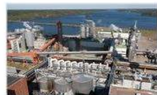
Process Industry (Fertiliser, Sugar, Paper & Pulp)