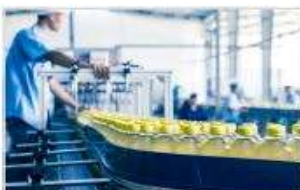
Bottling, Canning & Packaging