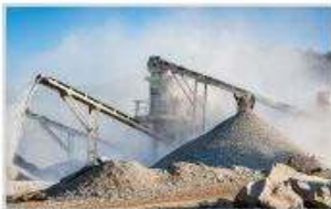
Cranes & Conveyors