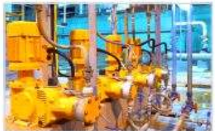
Fluid Machinery (Pumps, Fans & Blowers)