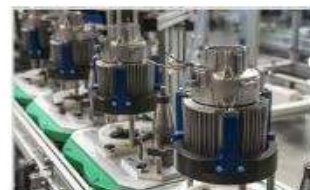
Industrial Electrical (Electric Motors & Circuit Breakers)