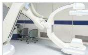
Medical (X-Ray & Imaging Equipments)