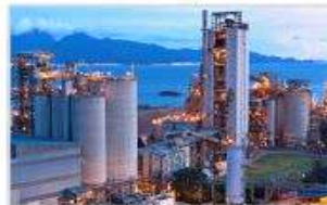
Cement, Mining & Minerals